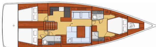
3 cabins + 2 washrooms